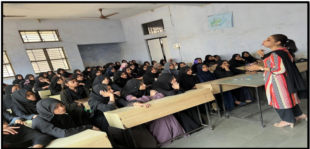
Participants of the Guest Lecture Program