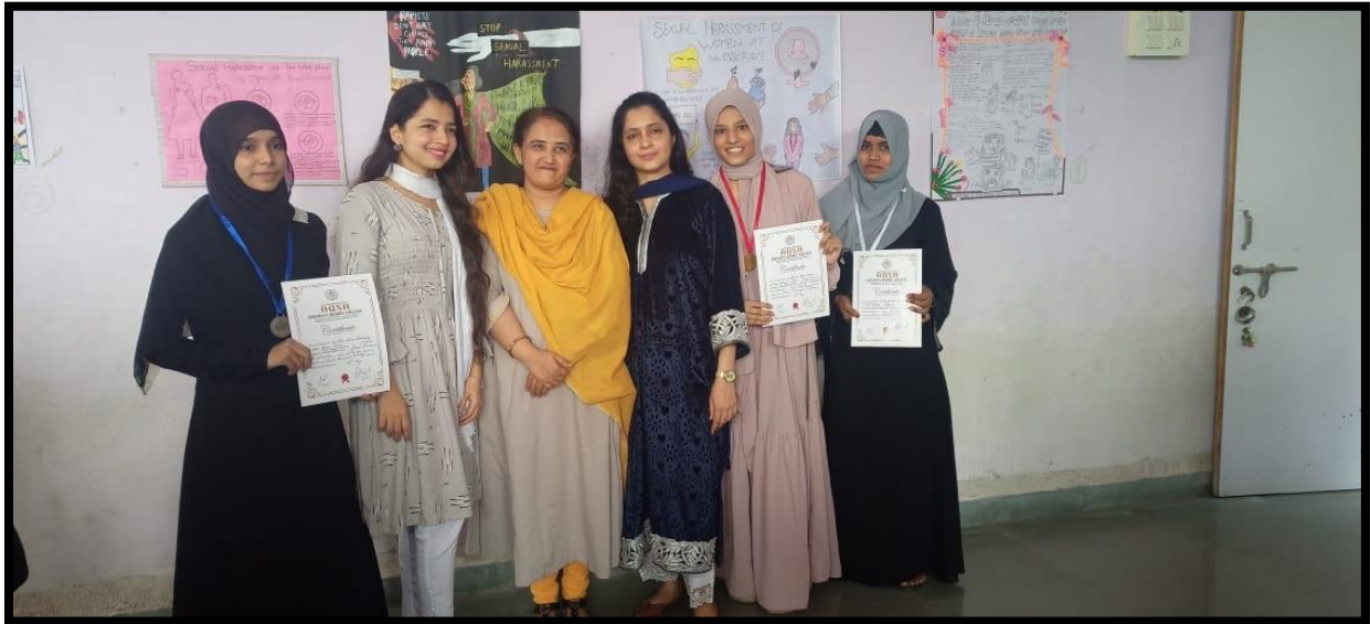
Winners of the competition