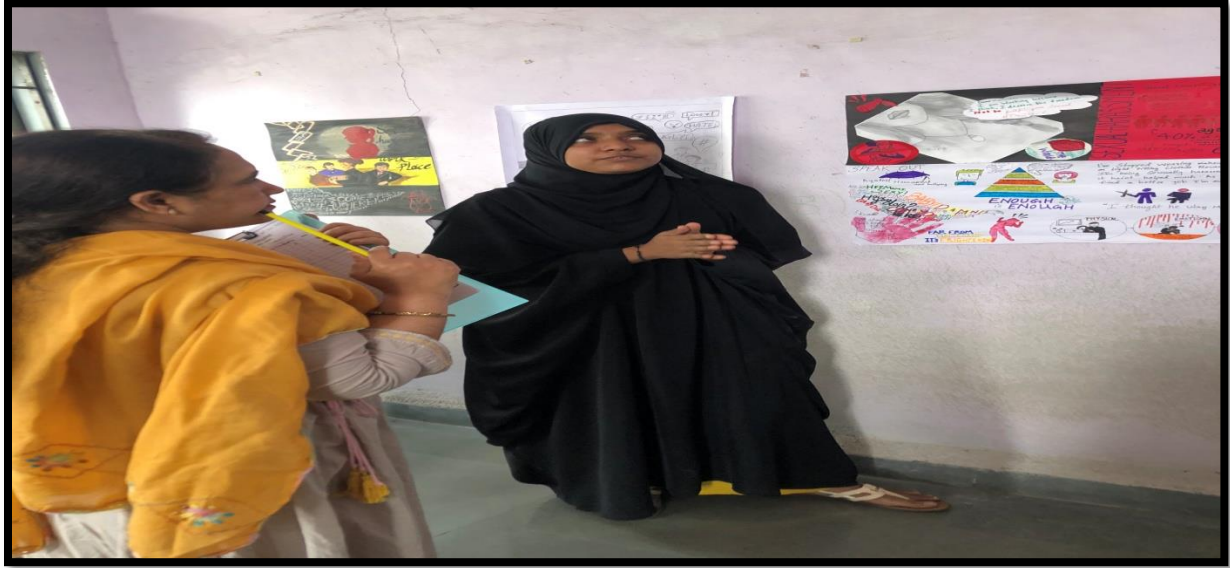
Student presenting the poster