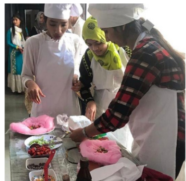
Meal Management & Nutrition Department