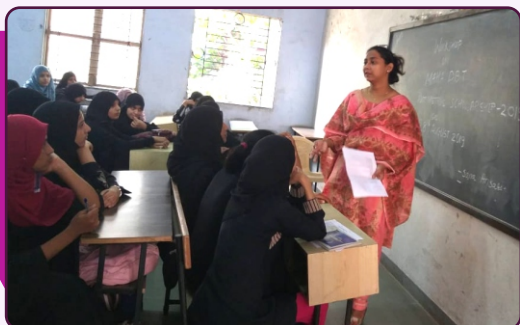
Ventilated & Spacious Classroom