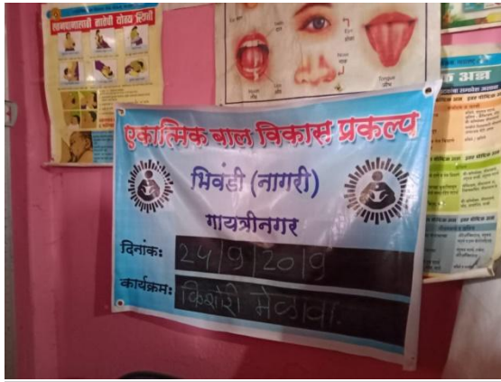
Visit to Balwadi in collaboration with Department of Meal Management