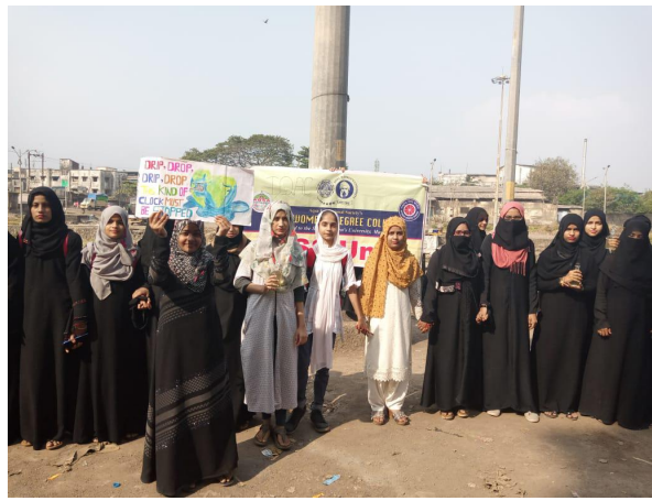
Volunteers performing survey and analysis Kamwari River.